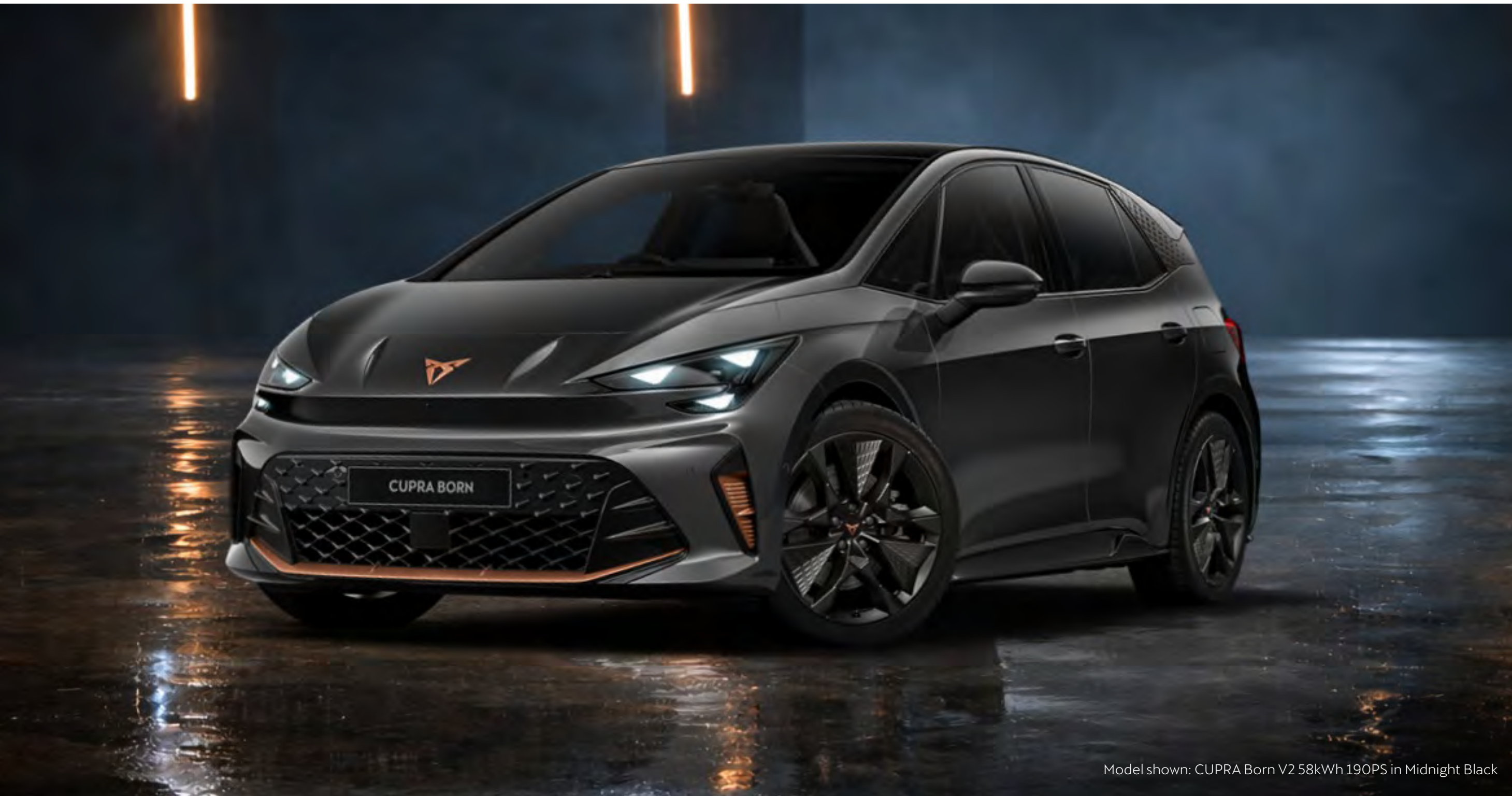
Model shown: CUPRA Born V2 58kWh 190PS in Midnight Black