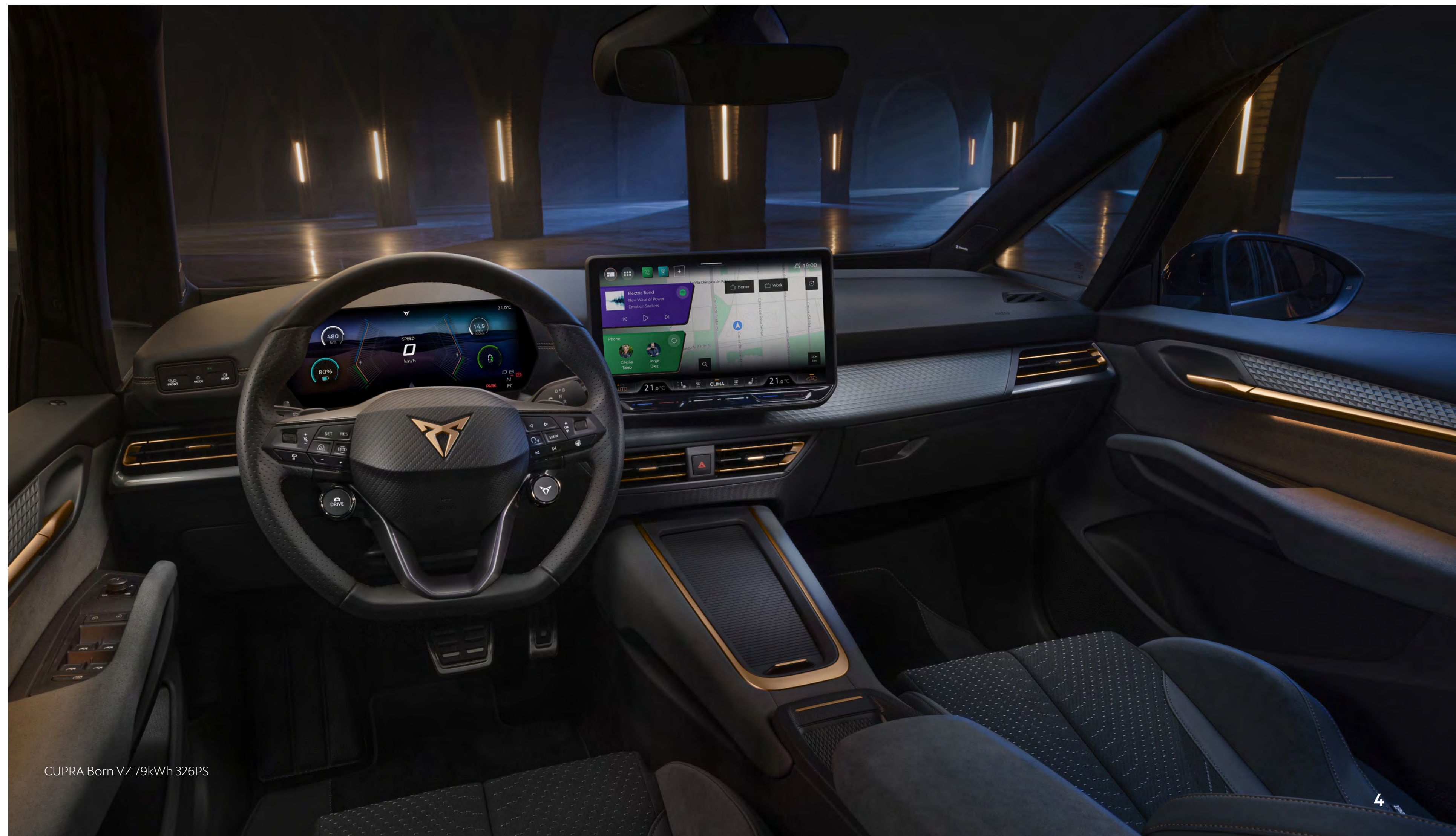
CUPRA Born VZ 79kWh 326PS