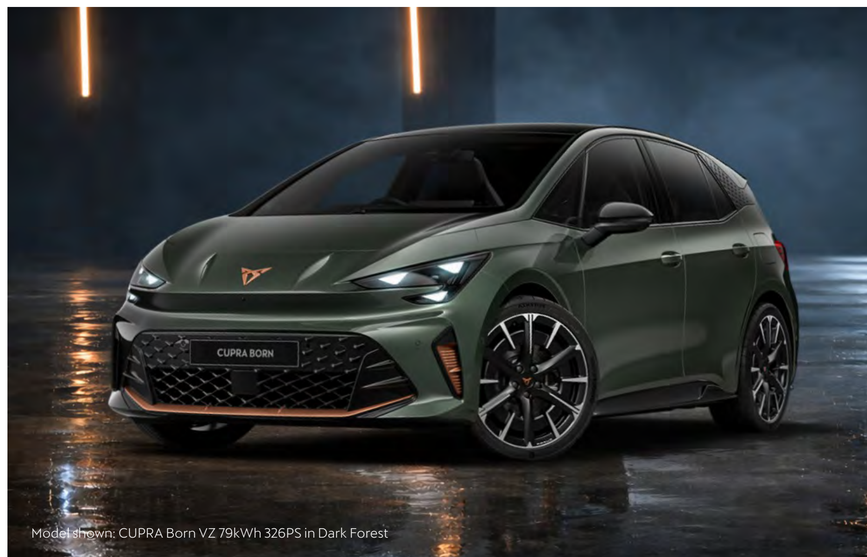
Model shown: CUPRA Born VZ 79kWh 326PS in Dark Forest