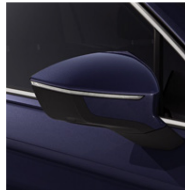
Atlantic Blue 2