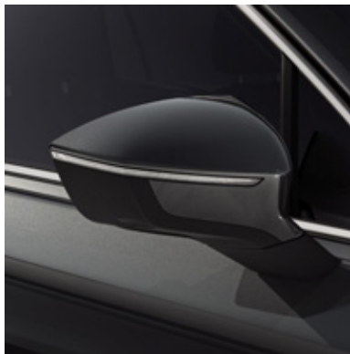
Dark Camouflage 2