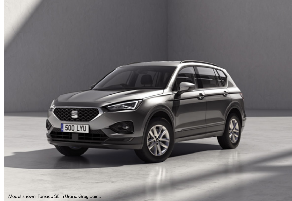
Model shown: Tarraco SE in Urano Grey paint.