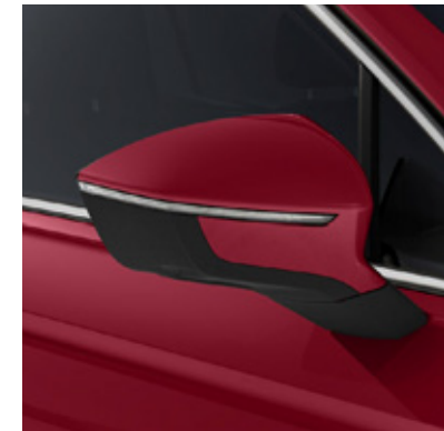
Merlot Red 2