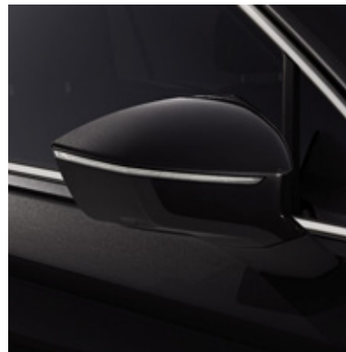
Deep Black 2