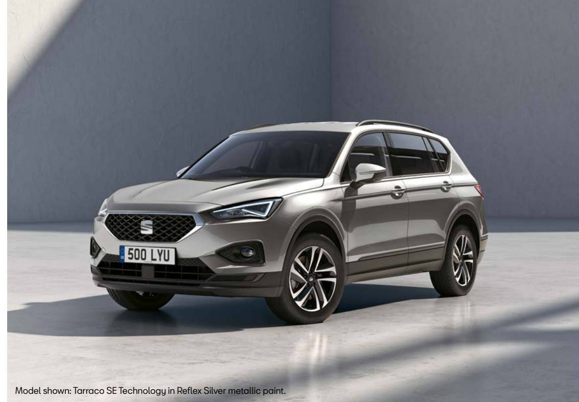
Model shown: Tarraco SE Technology in Reflex Silver metallic paint.

01. 18" 'Performance' alloy wheels. 02. Olot Black cloth.