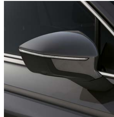
Urano Grey 1