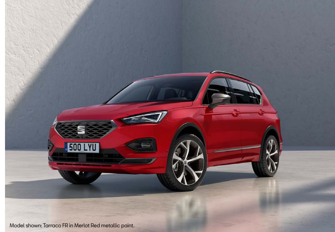
Model shown: Tarraco FR in Merlot Red metallic paint.

*Price is for Tarraco FR 1.5 EcoTSI 150PS.