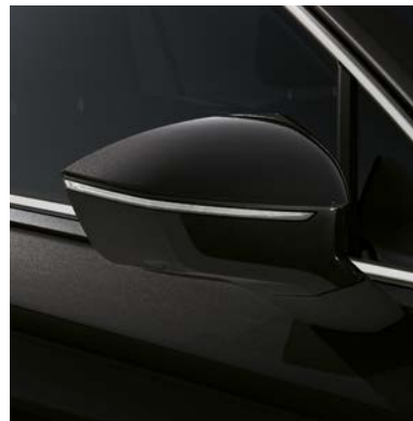
Deep Black 2