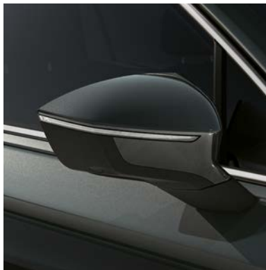
Dark Camouflage 2