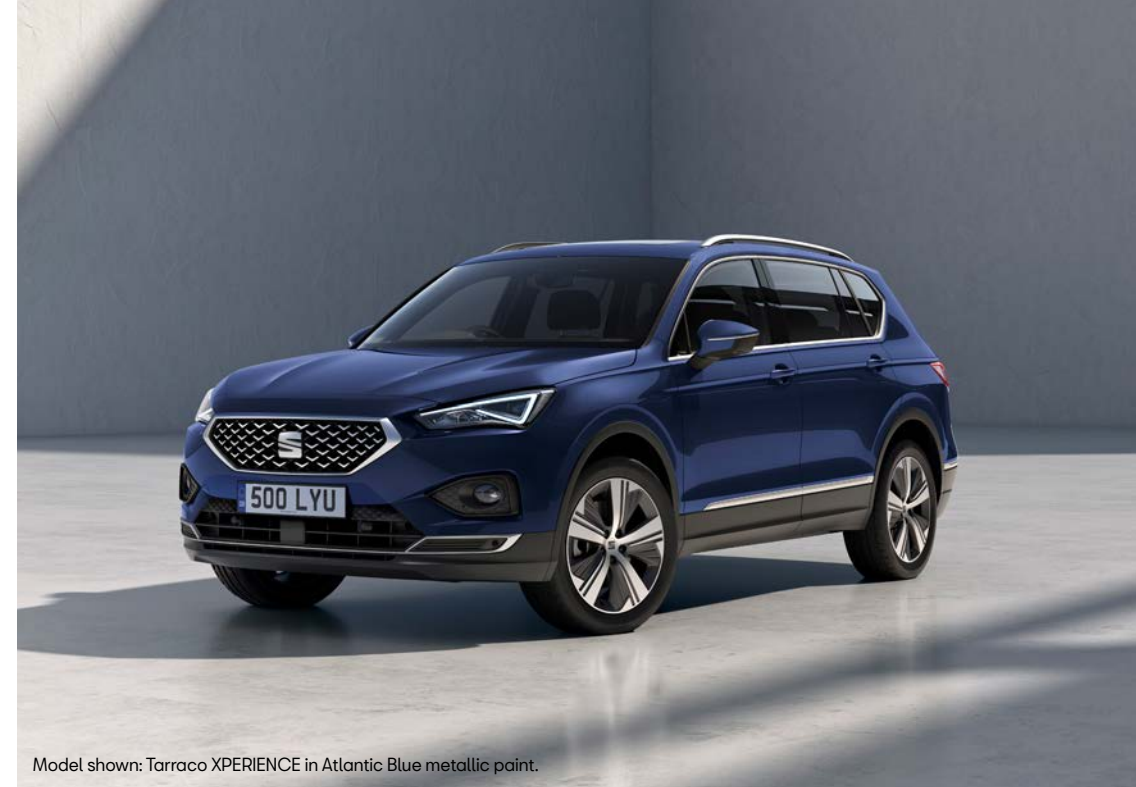
Model shown: Tarraco XPERIENCE in Atlantic Blue metallic paint.