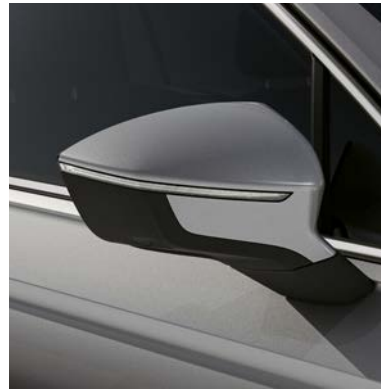
Reflex Silver 2