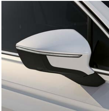
Oryx White 2

Print and screen view do not provide an exact representation of colour. Please refer to the paint colour moulds at your local SEAT Retailer.