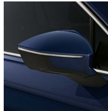
Atlantic Blue 2