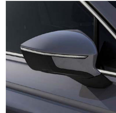
Dolphin Grey 2