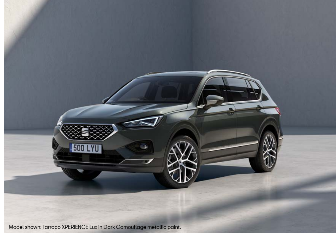
Model shown: Tarraco XPERIENCE Lux in Dark Camouflage metallic paint.