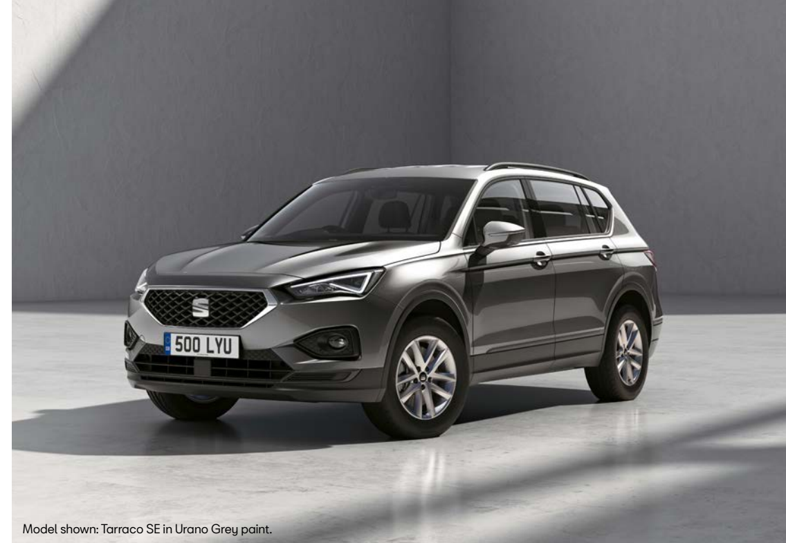
Model shown: Tarraco SE in Urano Grey paint.

5 The SEAT Tarraco. Pricing and specification list.