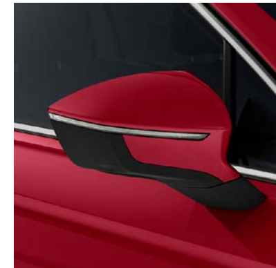
Merlot Red 2