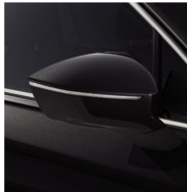
Deep Black 2