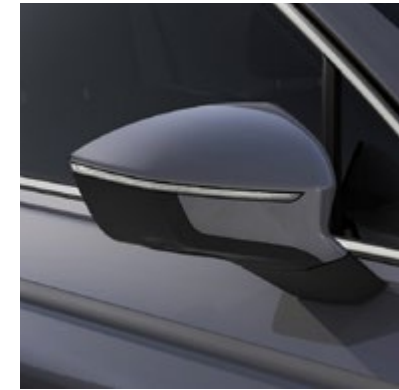
Dolphin Grey 2