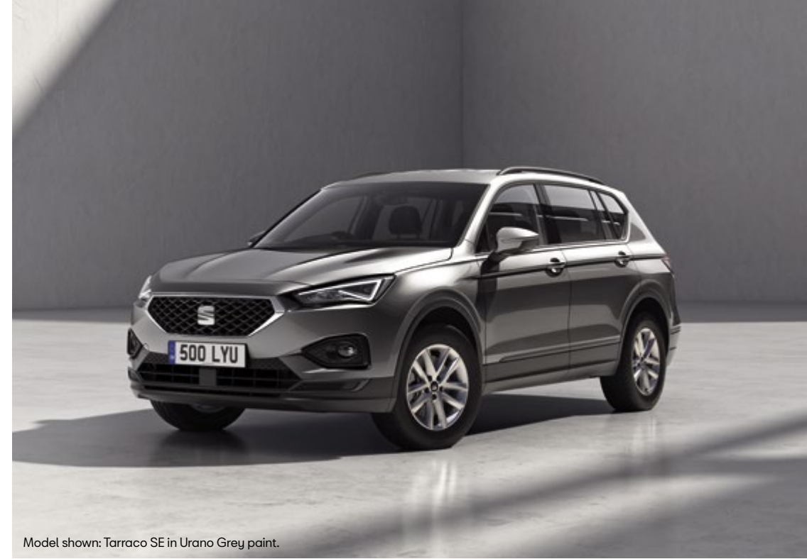
Model shown: Tarraco SE in Urano Grey paint.