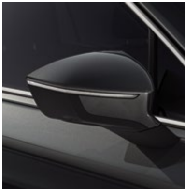
Dark Camouflage 2