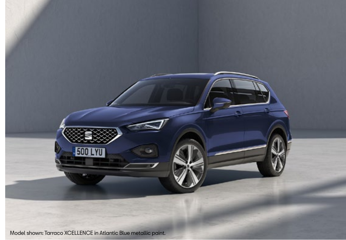
Model shown: Tarraco XCELLENCE in Atlantic Blue metallic paint.

02. Baza Grey cloth with brown Alcantara.