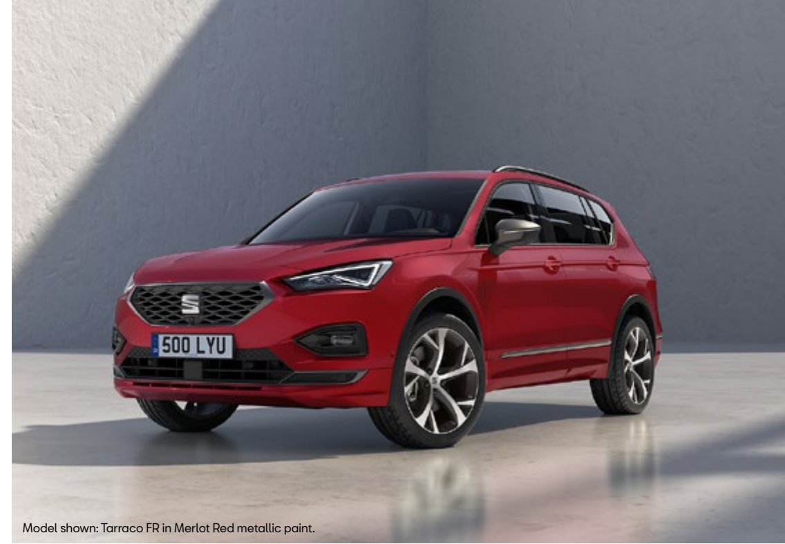
Model shown: Tarraco FR in Merlot Red metallic paint.

*Price is for Tarraco FR 1.5 TSI EVO 150PS.