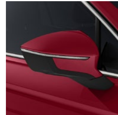
Merlot Red 2