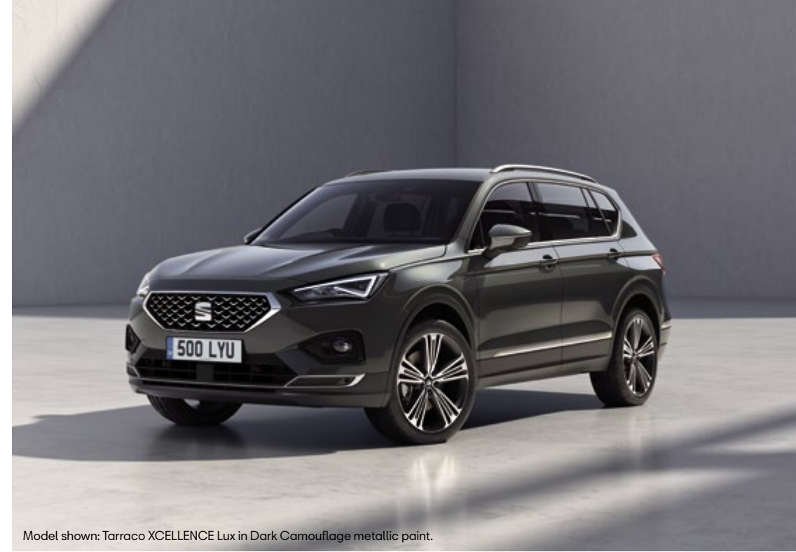
Model shown: Tarraco XCELLENCE Lux in Dark Camouflage metallic paint.