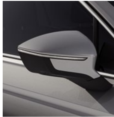
Reflex Silver 2