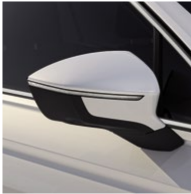
Oryx White 2

Print and screen view do not provide an exact representation of colour. Please refer to the paint colour moulds at your local SEAT Retailer.