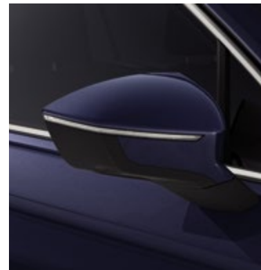
Atlantic Blue 2