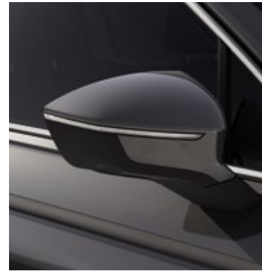
Urano Grey 1