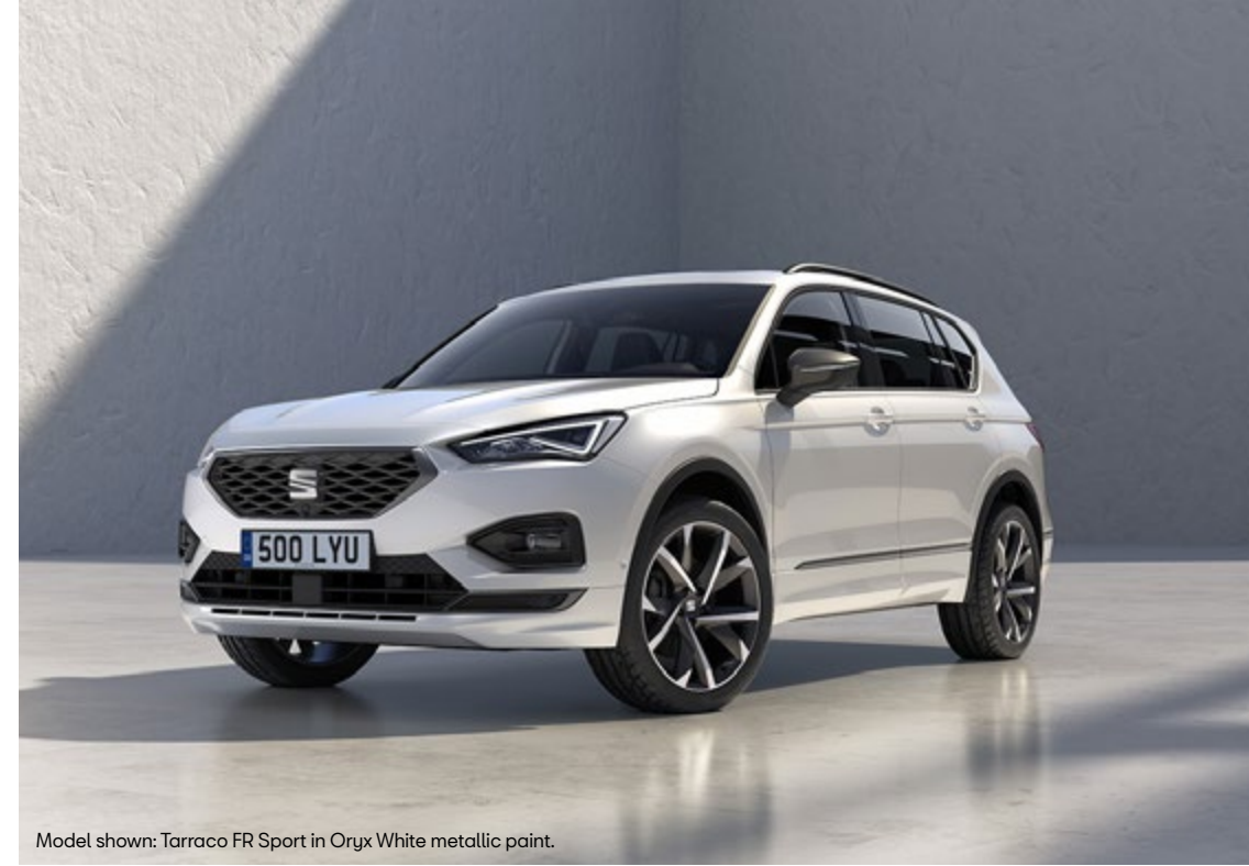
Model shown: Tarraco FR Sport in Oryx White metallic paint.

*Price is for Tarraco FR Sport 1.5 TSI EVO 150PS.