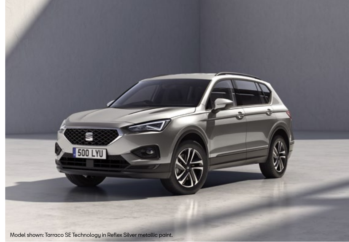
Model shown: Tarraco SE Technology in Reflex Silver metallic paint.