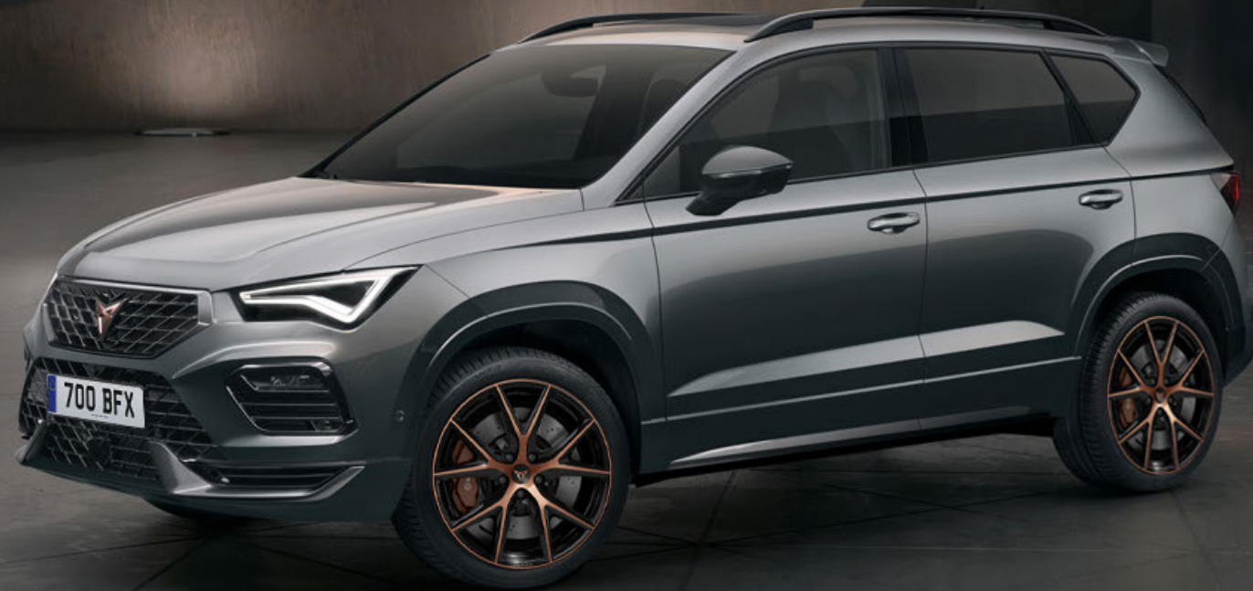
Model shown: CUPRA Ateca VZ3 in Rhodium Grey