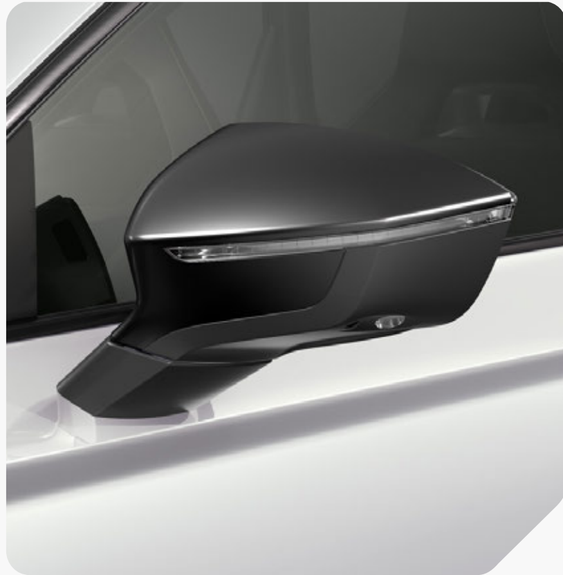
Bila White VZ1 | VZ2 | VZ3