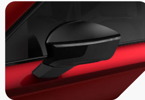
Velvet Red VZ1 | VZ2 | VZ3