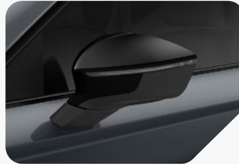
Rhodium Grey VZ1 | VZ2 | VZ3