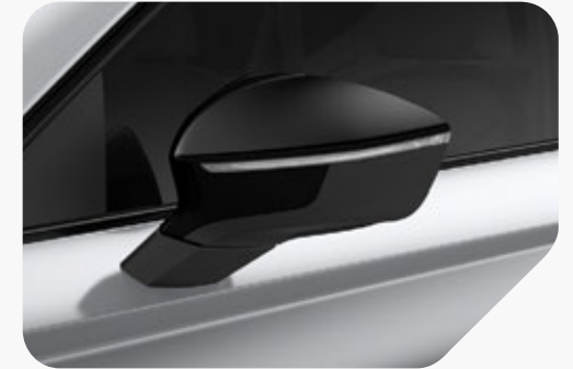
Nevada White VZ1 | VZ2 | VZ3