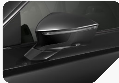
Black Magic VZ1 | VZ2 | VZ3