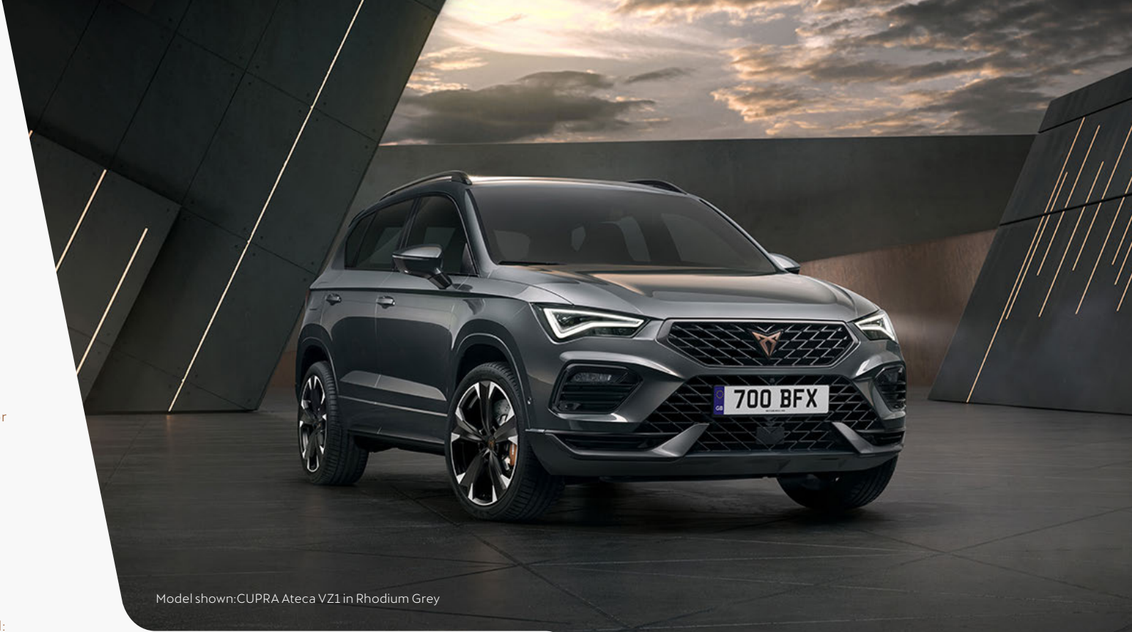
Model shown: CUPRA Ateca VZ1 in Rhodium Grey