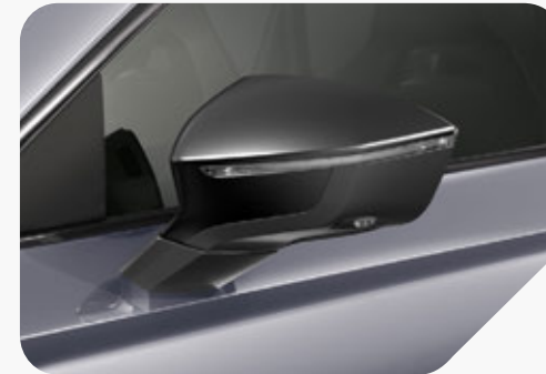
Reflex Silver VZ1 | VZ2 | VZ3